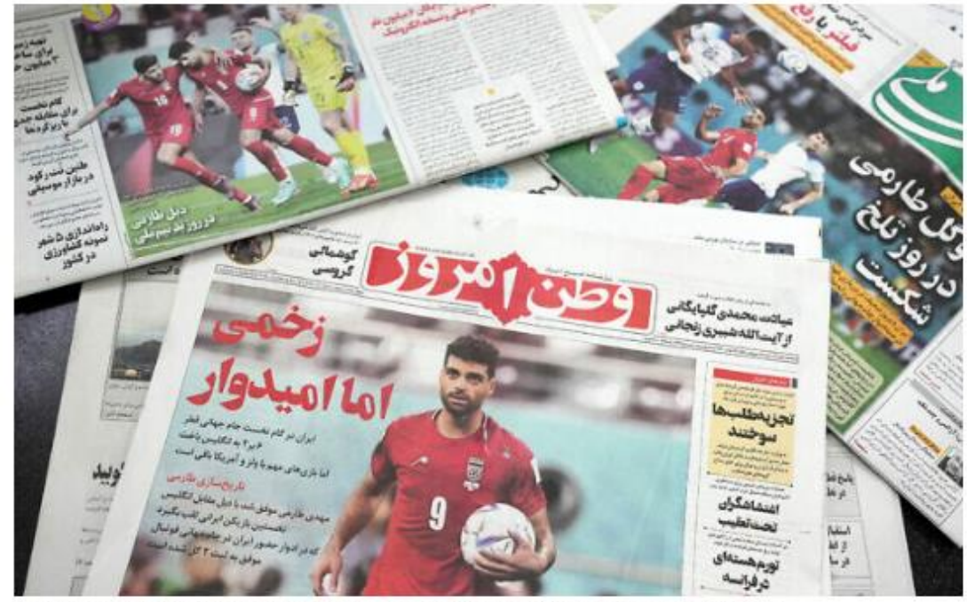
Iranian newspapers seen in downtown Tehran, Iran, Nov. 22, 2022.

TEHRAN — Iran has arrested a third female journalist from the reformist newspaper Shargh against the backdrop of nationwide protests sparked by Mahsa Amini's death, the daily said Wednesday.